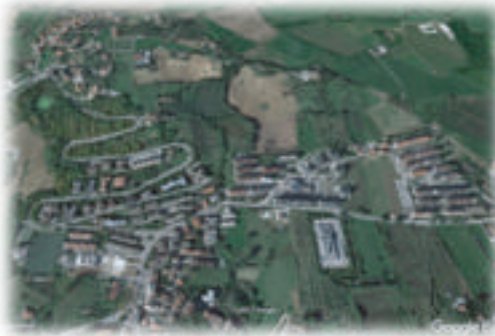
Coop Italdomus Colle Atterrato Basso - Teramo