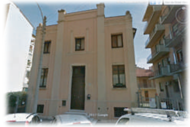
Recupero di ex opificio - Bologna