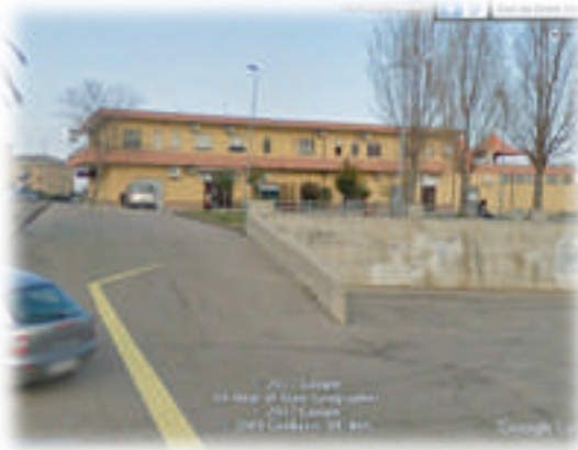
2000 sqm shopping center Termoli (Campobasso)