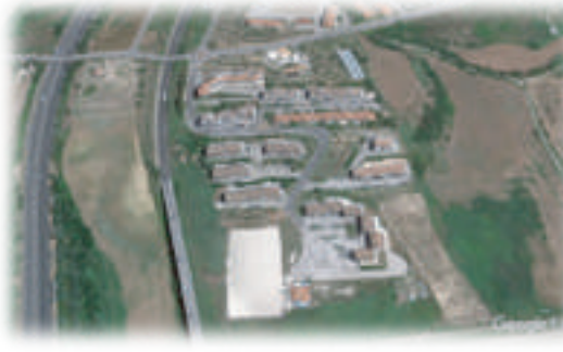
Consorzio Eurocasa - Termoli