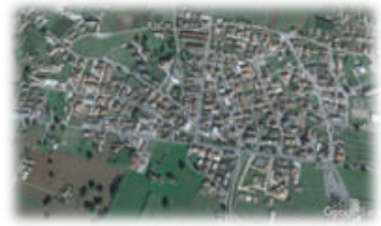
Piedimonte San Germano