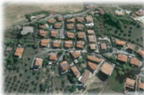
Consorzio Eurocasa - Pescara