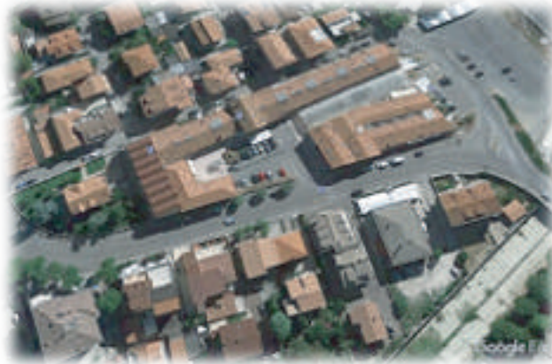
Recovery facility and conversion into multifunctional center of 20,000 square meters - Pineto (TE)