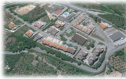
Coop La Molisana - Larino