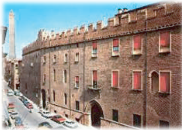
Palazzo Pepoli Antico - Bologna