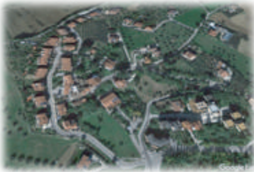
Coop Italdomus Colle Atterrato Alto - Teramo