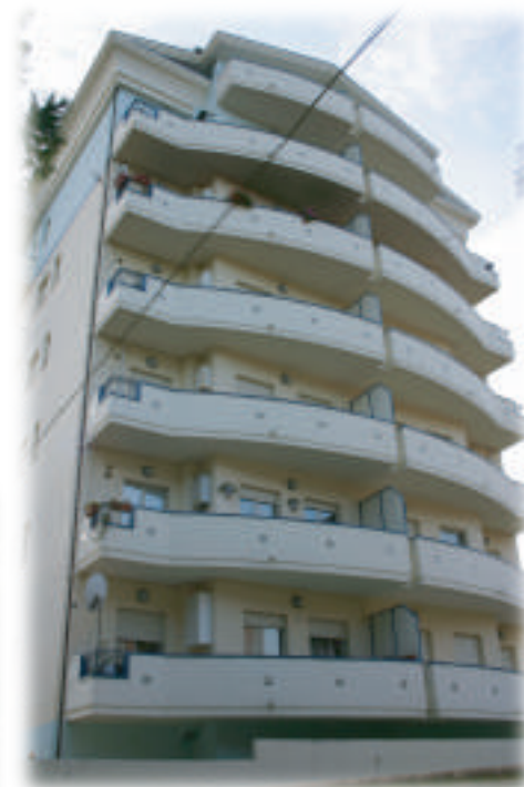
Consorzio Eurocasa - Montesilvano