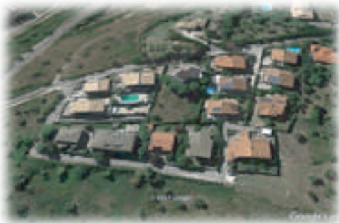
Consorzio Eurocasa - Pescara