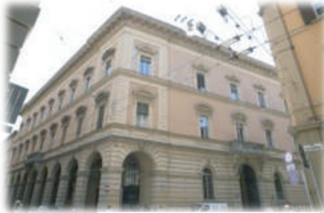
Palazzo Pizzardi Legnani - Bologna