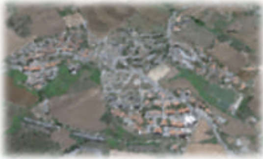
Coop Difesa Grande - Termoli