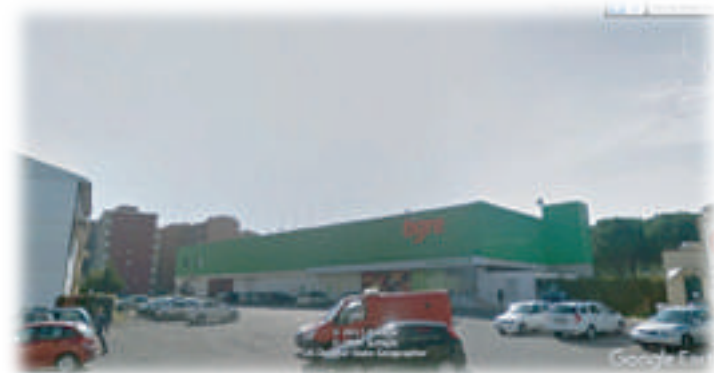
2000 sqm shopping center Termoli (Campobasso)