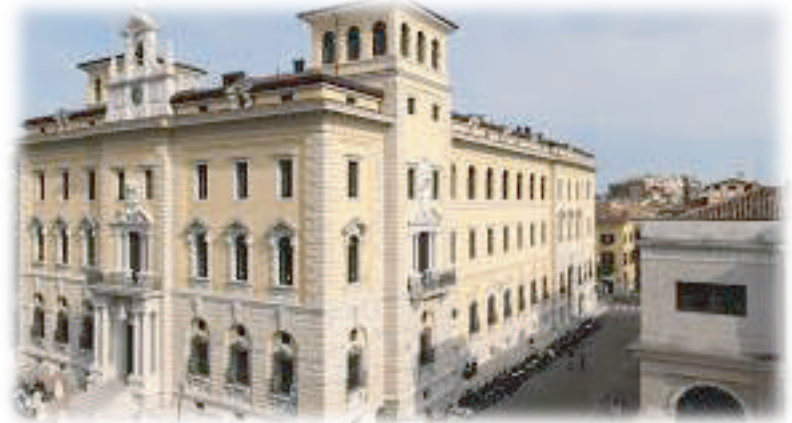
Palazzo delle Poste - Verona